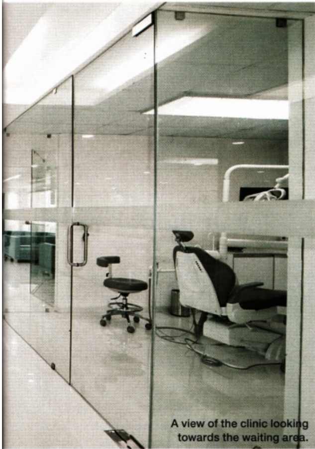
A view of the clinic looking towards the waiting area.