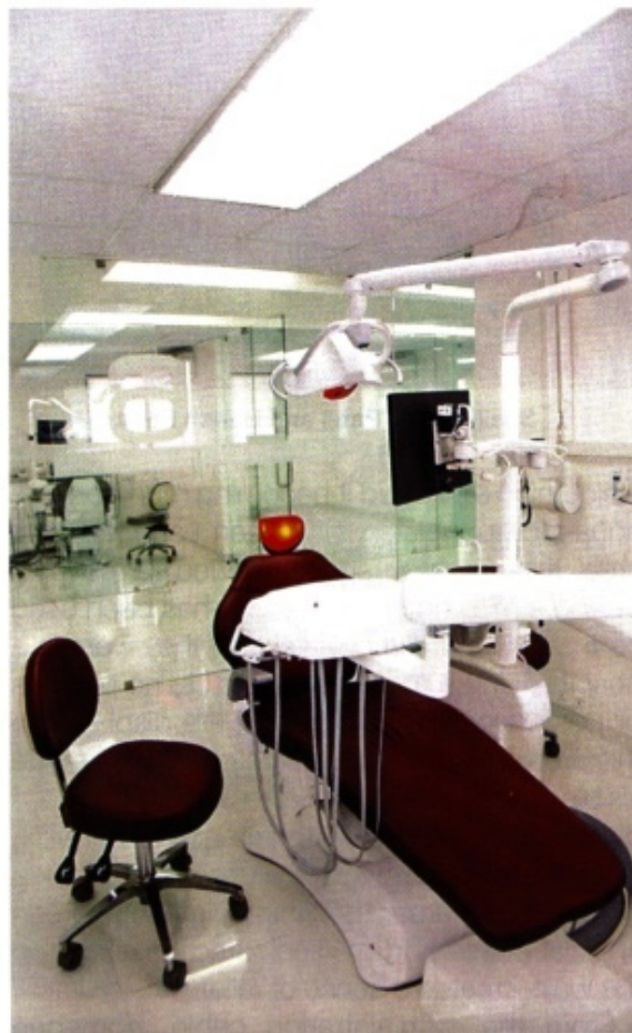
Ahmedabad's Teeth Care Centre is a welcoming space where architects Shailja Harish Design Studio have combined the best of aesthetics and functionality.

the tastes of their client base, which included both NRI and domestic patients.